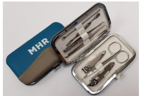
MHR manicure gift set