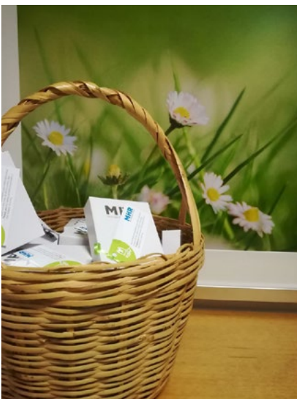
MHR Nurses' Day gifts

Below are photos of the MHR Nurses' Day gifts in the spirit of this momentous day. Each nursing panel member received a nurse's watch as a token of appreciation for offering quality patient care at all times.