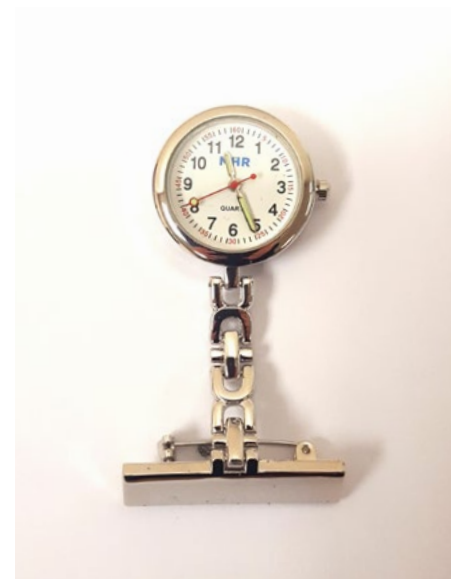
MHR nurse's watch

MHR commends each nursing panel member for making a difference in patients' lives.